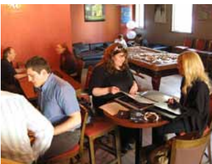
GDC Manitoba's Portfolio One-on-One is a unique event that brings together students and design professionals.

GDC Manitoba continues to play an important role in establishing the relationship between design practitioners and students entering the field. Through mentorship, portfolio reviews and disseminating information on best practices, I look forward to the continued involvement of the GDC in its relationship with members both new and old. We are in a field that involves constant learning and continual change, as forms of media and technology further transform our methods and our communication. I would continue to encourage designers at all levels of their careers to volunteer and become involved with mentoring students; there is education for everyone involved that is very rewarding.