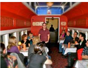
GDC Manitoba's Tales From the Dark Side event, an entertaining evening of design horror stories.

GDC Manitoba now boasts an established presence on Facebook and Twitter, largely to assist in keeping individuals abreast of events and notifications the chapter has to offer. The chapter's Twitter feed (currently with 81 followers) was live and busy during October's BlueSky conference, updating on the fly with up-to-the-minute details, and our Facebook page currently maintains an active network of just under 100 contacts.